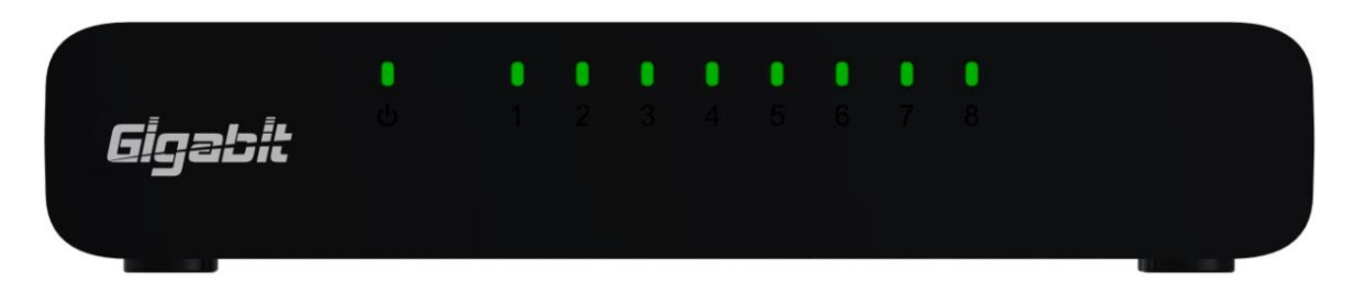
8-Port Gigabit Desktop Switch